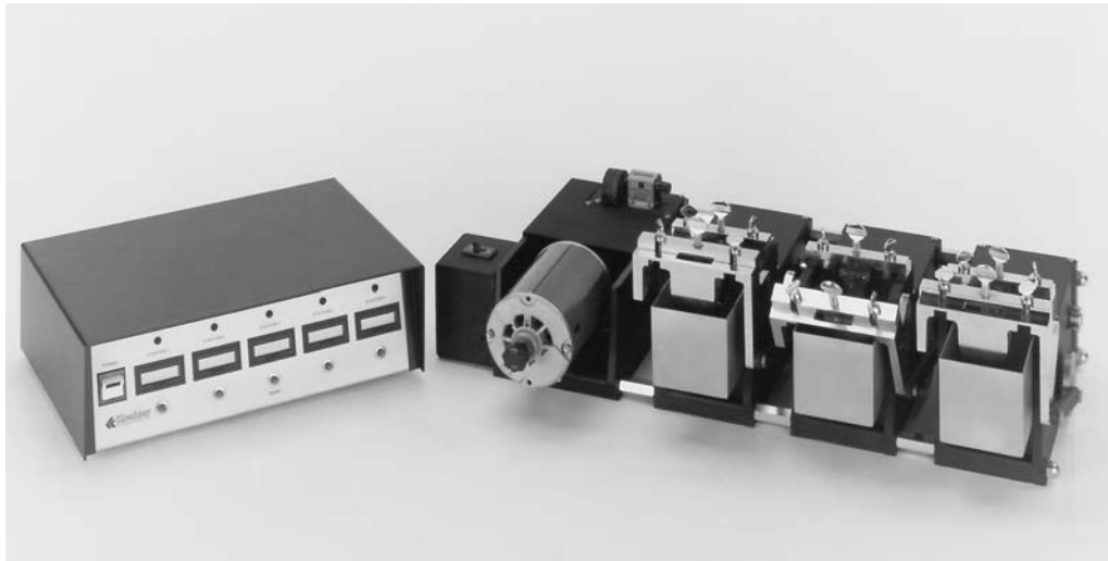
FIG. 1 Maeser Water Penetration Tester (continued)

the steel balls. The common electrode is in a salt solution which is in continuous contact with the specimen during flexing.